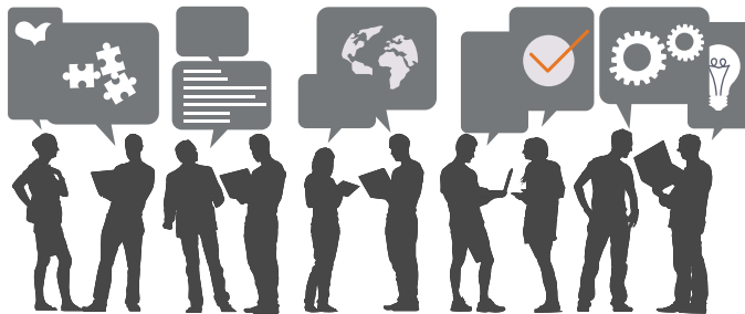
Theme 4: Community Engagement