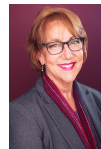
Patty Raun Center for Communicating Science