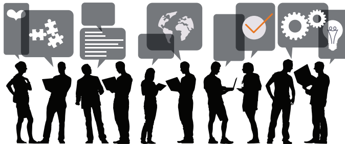
Theme 4: Community Engagement